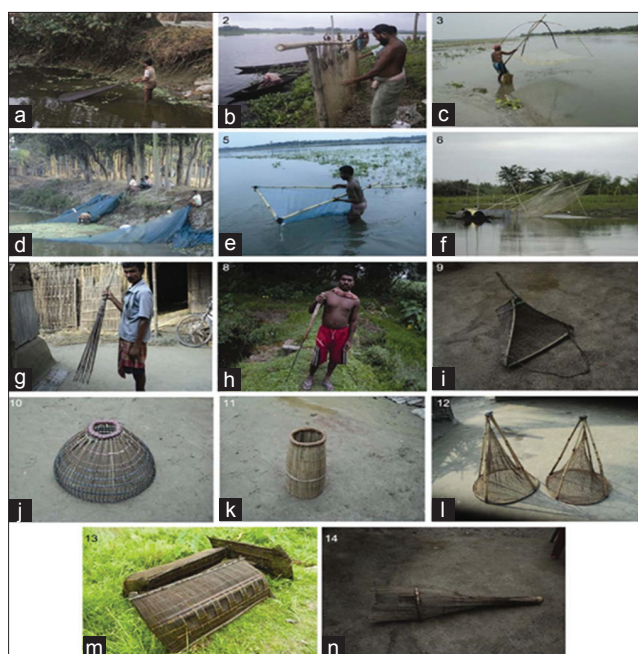
Figure 2: (a-n) Fishing gears operated in Cooch Behar district. (a) Cast net, (b) gill net, (c) lift net, (d) drag net, (e) push net, (f) stationary lift net, (g) Koncha or Teta, (h) Shuli, (i) Zakoi, (j) Pala, (k) Jhoka, (l) Chalk, (m) Tapai, (n) Burung

meshed mosquito net. It is locally called Tana Jal. During fishing by cloth net, two persons hold the net at opposite ends and lift it from the water when sufficient numbers of fishes are trapped. Cloth net is implemented throughout the year except for monsoon months in ponds of Cooch Behar district. The fishes usually caught by cloth net are Puntius spp., A. mola , and Esomus denricus .