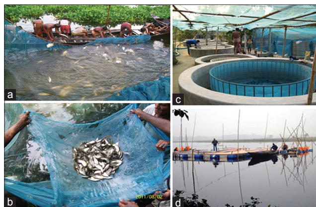
Figure 3: Fish production activity photograph. (a) Catching Fish at Chaitarchhara, Sahebganj, Dinhat-II Dev. Block, (b) “Chital” fish sampling under RKVY, 2010-11 scheme, (c) Gadadhar fish seed farm, Tufanganj, (d) Cage culture under RKVY, 2010-11 at Chadga Beel, Nakarkhana, Tufanganj