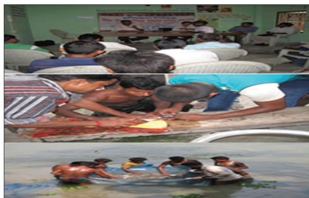
Figure 1: Training on fish production by Cooch Behar Krishi Vigyan Kendra

Puntius spp., Mastacembelus sp., Wallago attu , Labeo rohita and so on are caught. It is also a major fishing gear operated in rivers and beels throughout the year.