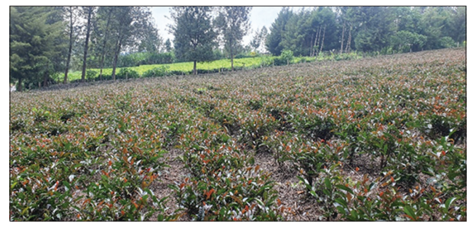
Figure 3: A smallholder purple tea farm in Sotik subcounty, Bomet, Kenya

Green tea is derived from the green leaves, buds, and shoots of the C. sinensis plant, and is processed