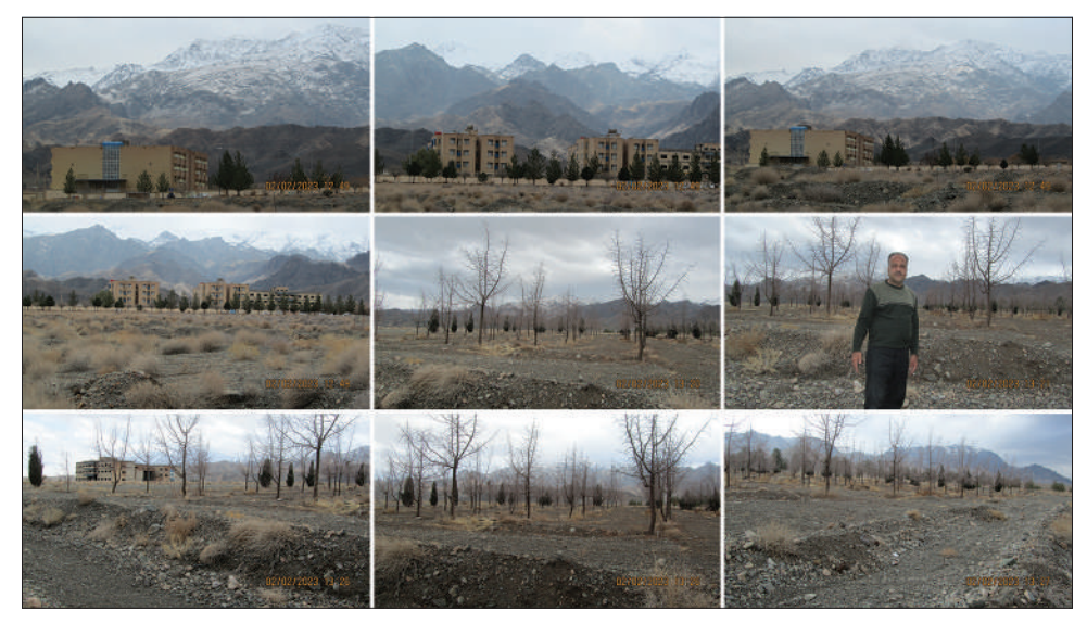
Figure 8: Author with his students in M.SC. and Ph.D. course from Iran and Afghanistan - in agricultural extension and education course in their final exams. Plus, some pictures from dormitory of students and Jujube garden near Bagheran mountain - in the Islamic Azad University Birjand Branch – Birjand, Iran. (Jan 31. 2023 and Feb 2, 2023).

increasing their internal flexibility in the deployment of that workforce, allowing them to react swiftly and decisively to changing external market circumstances [Figure 8]. Because training can, at least theoretically, simultaneously strengthen the employment security of citizens and the (internal) flexibility of firms, (education and) training institutions can be seen as a flexicurity arrangement.<sup>[12,13]</sup>