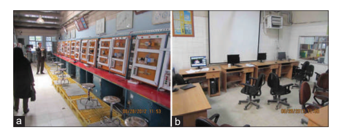
Figure 4: (a and b) Some computers and internet site and educational aids in Iranian TVE system in branch of South Khorasan Province in -East of Iran (By author, Aug 28, 2012)

need for a highly skilled and productive workforce is shaping economies all over the world. To increase their chances for employability, young people and adults need skills that are flexible and relevant to the demands of today's societies, where individuals must possess a combination of knowledge, practical and social skills and positive attitudes, as well as the ability to think and act independently, creatively, and responsibly. If TVET is to meet such diverse expectations, substantial changes are required, and