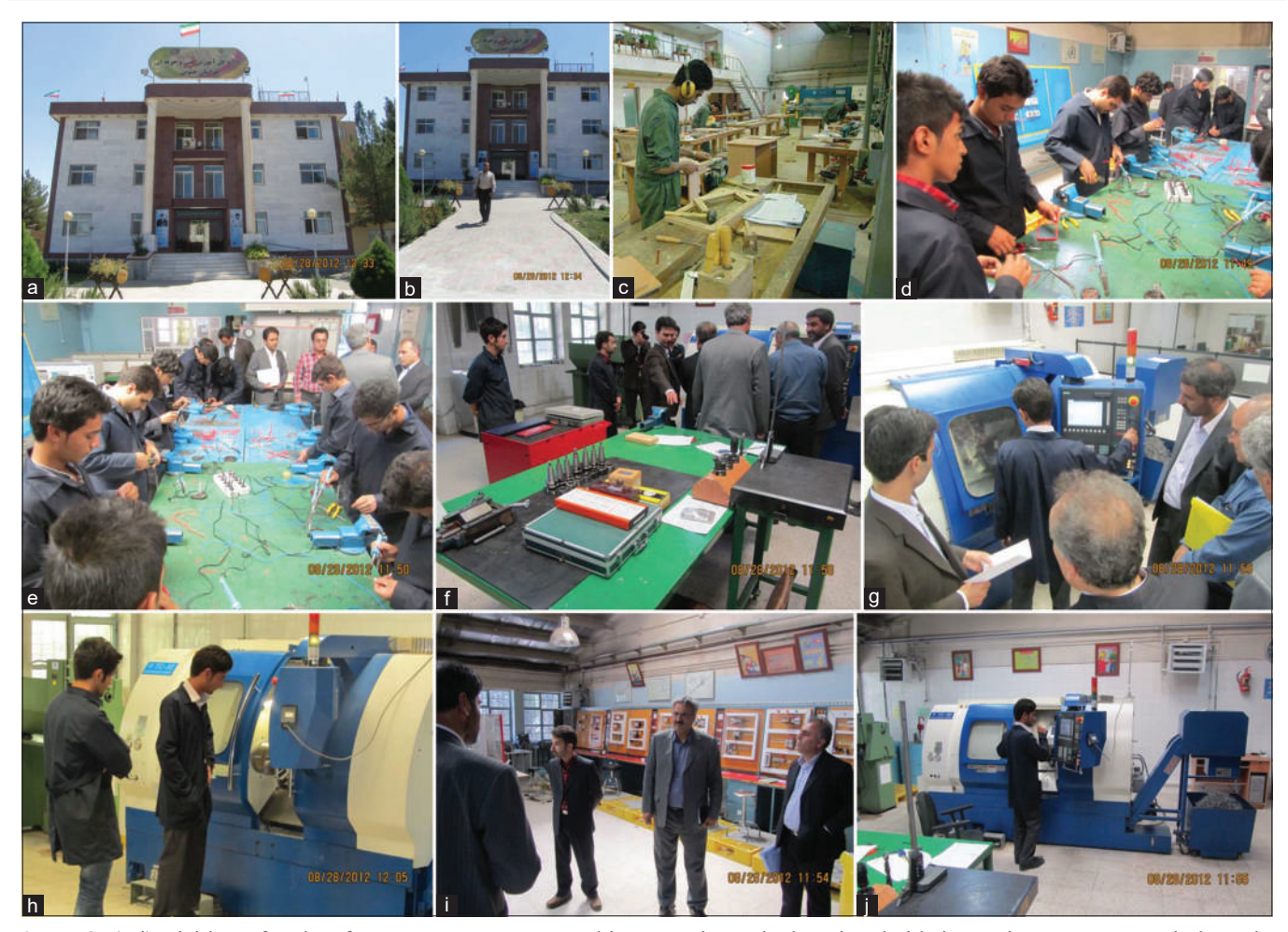
Figure 3: (a-j) Visiting of author from some computers and internet site and educational aids in Iranian TVE system in branch of South Khorasan Province in -East of Iran (By author, Aug 28, 2012)