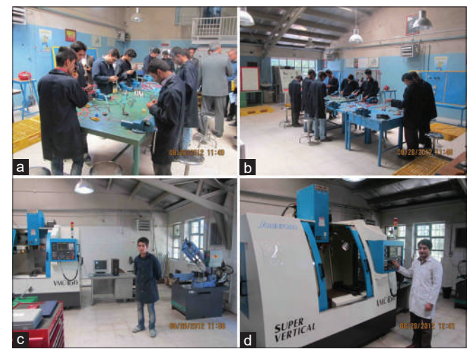
Figure 5: (a-d) Students of mechanic course in work with modern automatics machines in Iranian TVE system in branch of South Khorasan Province in - East of Iran

need for a highly skilled and productive workforce is shaping economies all over the world. To increase their chances for employability, young people and adults need skills that are flexible and relevant to the demands of today's societies, where individuals must possess a combination of knowledge, practical and social skills and positive attitudes, as well as the ability to think and act independently, creatively, and responsibly. If TVET is to meet such diverse expectations, substantial changes are required, and