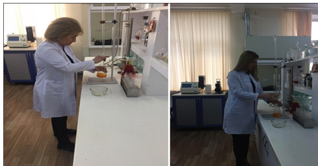
Figure 2: Laboratory analysis of soil samples

one hectare of washed land into one hectare means that the entire area of one hectare is completely covered with furrows, which is impossible.