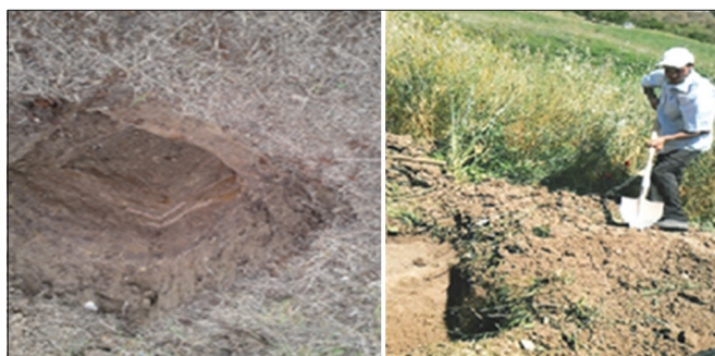
Figure 1: Field soil erosion studies

Of course, we do not consider such a calculation of the amount of washed soil to be methodologically correct. This is explained by the fact that turning