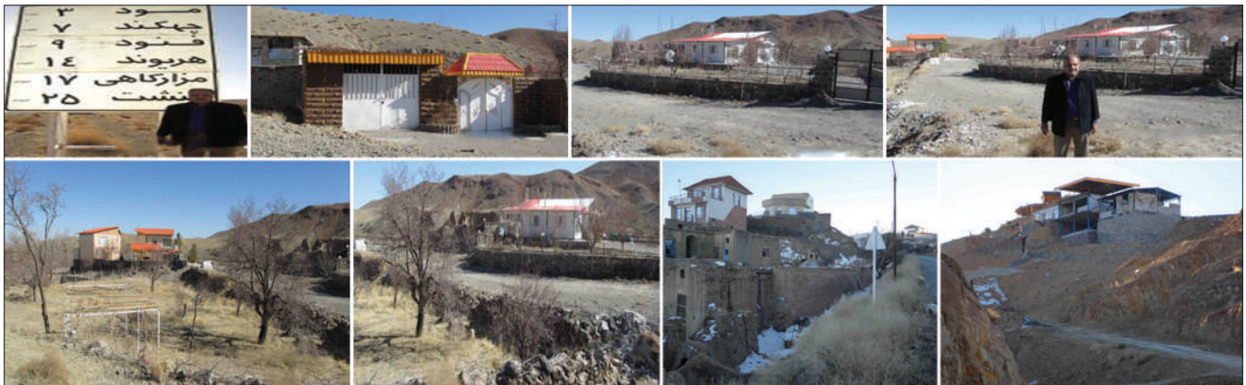
Figures 45-52: Establishing modern and expensive second houses inside of gardens, farms and over and in domain of the mountains and hills, by wealthy urban people in recent decades In Hariwand, Fanood, Kahi and Khorashad villages (25 - 70 Km distance to Birjand, center of South Khorasan province, east of Iran) (Jan 2, 2013 & January 2021).

living standards for farmers. According to some studies, the optimum farm size for economic crop production should be at least 12 ha. Summarizing these arguments, land fragmentation is considered as one of the major obstacles to achieve sustainable rural livelihoods, in Iran. Accordingly, the extensive arrays of smallholdings need to be restructured and consolidated. A better understanding of the causes of land fragmentation in Iran is needed, especially now that the country is confronted with the challenge of agricultural modernization resulting from its entry into the World Trade Organization (WTO) etc. (Figures 3-24).