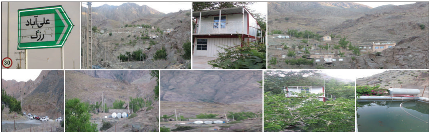
Figures 36-44: Establishing second houses and gardens over and in domain of the mountains and hills that caused destruction their environment and natural resources, in Razz village (12 Km distance to Birjand, center of South Khorasan province, east of Iran) (Pictures by author, Spring and Summer 2020).