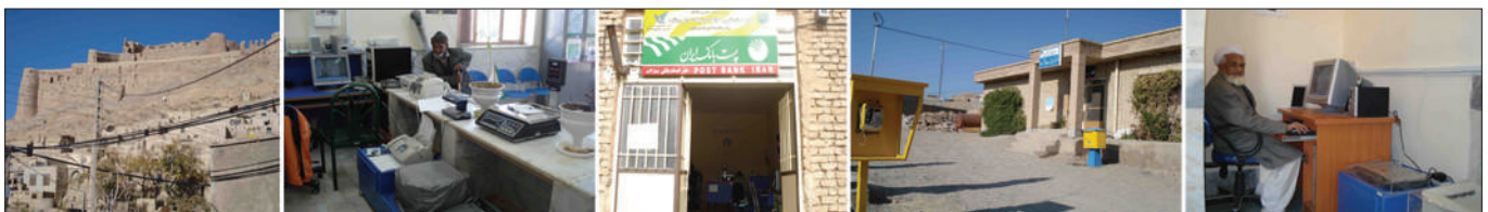
Figures 65-69: Establishing infrastructures of electricity, telephone lines and Tele-center for improving life conditions of rural people. In Forg village (first picture) and Tele-center in Kalate nasir village - and Post Bank in Bijaem villages (second and third pictures) Tele - centers in Bojd and Khorashad villages (two last pictures). These villages are between 50 – 100 km distance to Birjand - east of Iran (By Author, 2010 - 2020).