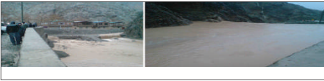
Figures 59-60: Floods and their damages that caused loss of valuable water after a long period of drought in South Khorasan province, east of Iran (By author, Feb 2012).