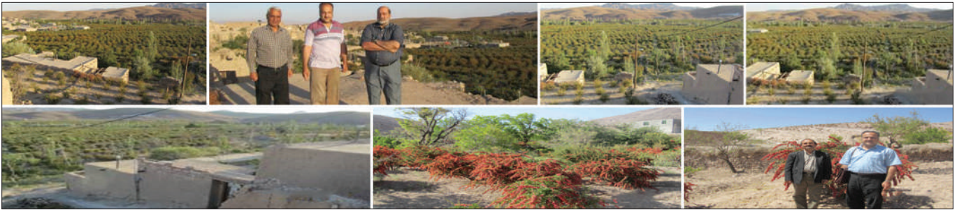
Figures 27-33: Planting of barberry ( Berberis vulgaris ) gardens that resistance to dried conditions as a main source of income for sustainable rural livelihood in desert regions in a disadvantaged rural region (Sarab and Zirg villages, 100 & 50 km distance to Birjand, center of South Khorasan province, east of Iran). Author with a poor farmer (last picture) that he died because of disease in 2013 (Five first pictures in Sarab village, Aug 6, 2021. Two last pictures in Zirg village, Oct 7. 2012).

removal of agricultural fields and productive lands to provide space for more urban construction. In this regard, during the last four decades, the country has experienced 40% of growth in its population size and urbanism rate, which are also projected to continue during the upcoming decades. Urban expansion on agricultural land-use intensity is associated with a reduction in agricultural land-use intensity and GDP in industrial sector negatively affects farmland intensity. By establishing appropriate socio-economic and cultural-recreational attractions in areas with lower levels of competition, the pressure of future population growth can be shifted to areas with higher suitability for urbanization and lower competitions with farmlands (Figures 36-52). [21-32]