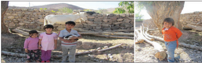
Figures 25–26: Children with poor health and education conditions in a disadvantaged rural region (Zirg village, 50 km distance to Birjand, center of South Khorasan province, east of Iran) (By author, Oct 7, 2012).

often do not consider small farmers as credit-worthy. Rural households often attempt to smooth consumption through reciprocal gifts and informal credit. Formal lending institutions in rural areas may be unwilling to lend money to small farmers as the latter may offer collateral in unacceptable forms (e.g., a small plot of land, and livestock). However, informal moneylenders – the landlord, the shopkeeper and the trader – are in a position to accept collateral in exotic forms. In addition, informal moneylenders often have much better information regarding the activities and characteristics of their clientele. Notwithstanding the existence of such informal mechanisms in rural credit markets, rural residents may be considerably assisted in their risk management by interventions that lead to better access to financial instruments by the rural poor. [1-10]