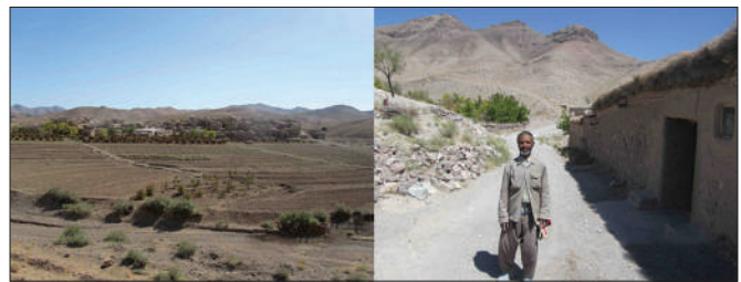
Figures 34 - 35: A poor farmer and his clay house in a disadvantaged rural region (Zirg village, 50 km distance to Birjand, center of South Khorasan province, east of Iran) (By author, Oct 7. 2012).

Land-use efficiency differs according to land use needs, for example, whether the land is used by large agricultural enterprises: Associations, cooperatives, and research and education establishments or used by smaller or larger private households. Increasing land-use efficiency is a topical issue in many countries; therefore, indicators of land efficiency measurement systems and ways of calculating economic land efficiency are being developed. Low productivity of small-holder farmers, their limited access to land, combined with water shortage, excessive ground water withdrawal, inadequacy of irrigation systems and excessive post-harvest losses, aging farmers with low literacy, who have limited access to quality seeds of improved variety, are main problems in agriculture system in Iran. For