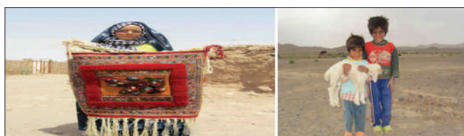
Figures 57–58: Nomadic lifestyle people and their traditional woman carpet weaver and children with poor health and education conditions in a disadvantaged and dried region near Qaen, 110 km distance to Birjand, center of South Khorasan province, east of Iran (By author, May 27, 2012).

E with a total area of approximately 1,650,000 km 2 . Elevations range from 26 m below sea level on the shores of the Caspian Sea to 5671 m above sea level at the peak of the Mt. Damavand. Drought is one of the most critical factors in Iran. About 50% of Iran can be classified as arid or semi-arid zones. There is not a good annual rainfall distribution in most regions of Iran. Not only high temperature in southern, central and lowlands of Iran is a limiting factor, but also low temperature in northern, western and highlands is another limiting factor too. In the South Khorasan Province, a greater portion of land during last decade became warmer than before. This confirmed the overall global warming in the world. The results derived from the trends of climate index confirmed this fact that the overall climate of the province became worse because more than 76% of the lands showed that the region goes to the drier condition (Masoudi et al. , 2018).