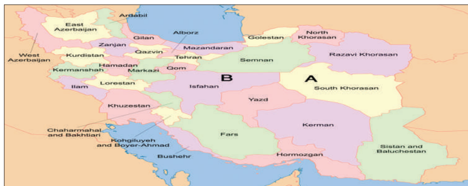
Figure 1: Map locations of doing this study, A (south Khorasan Province, east of Iran) and B (Isfahan province, center of the country). (Iranian Bureau of Statistics, 2021)

Rural population in Iran live in an unstable environment and geographically, villages are extremely diverse and more than 65% of them have population less than 250 persons, which do not provide sufficient population threshold for most of