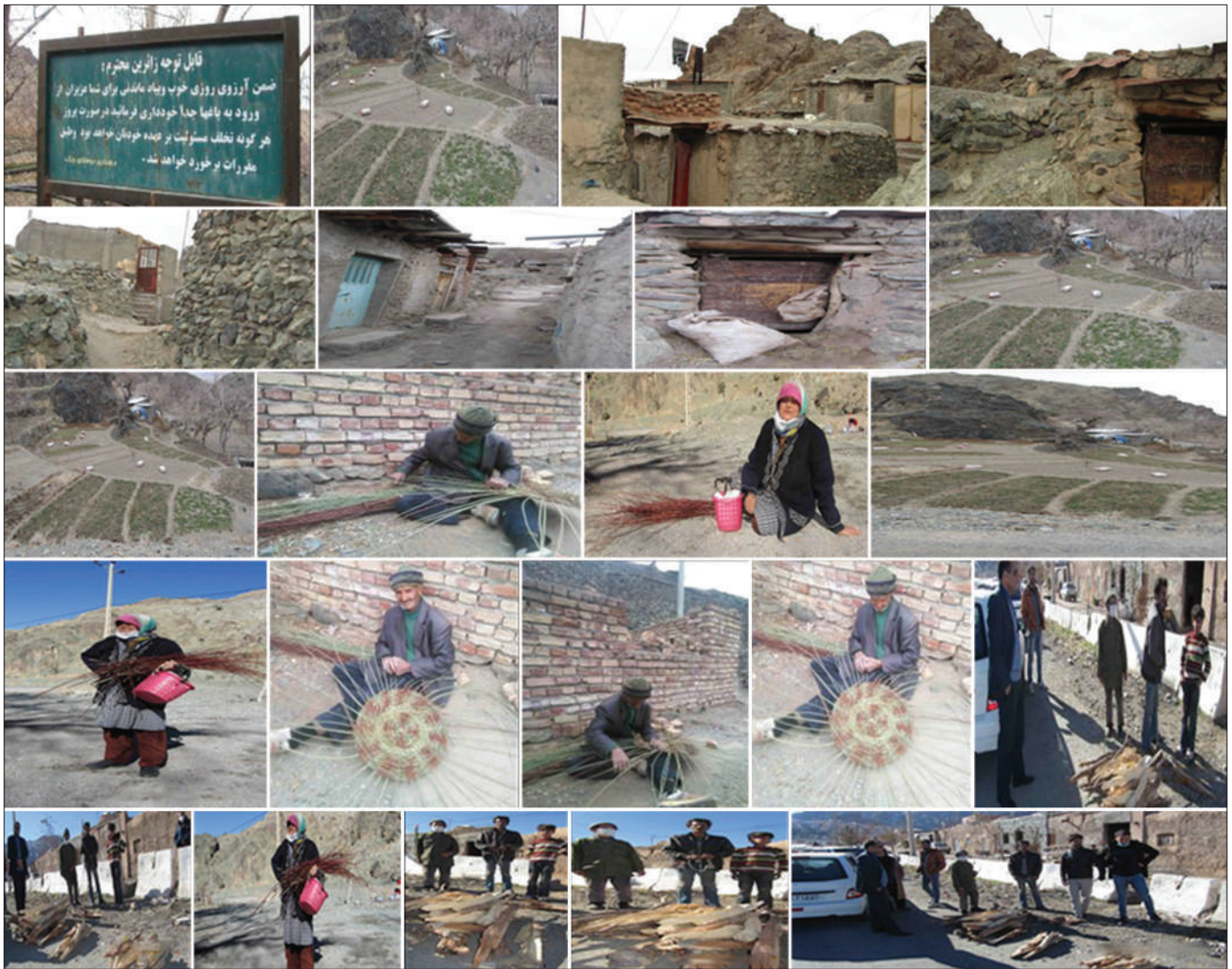
Figures 3-24: Land fragmentation, peasantry and small holdings as major type of agricultural production system in Razz, Kaseh Sang and Amir Abad Sheybani villages, (7-12 Km distance to Birjand city, center of South Khorasan Province, east of Iran). Also in these pictures observe traditional houses that made by natural materials, handicrafts by old men and women by utilizing stems of mountain shrubs and small trees. Plus selling wood by rural people beside of road in their village to nature tourists for making fire for cooking food, tea etc. in domains of Baghearan mountain. This phenomenon is because of high rate of poverty and unemployment in this disadvantaged and isolated region of Iran.

migration processes (in, out, and return migration) will be evident, irrespective of the overall net migration or population change. With declining natural change variation in population growth rates is increasingly the product of in and out-migration processes. Rural depopulation has been endemic since the beginning of land reformation programs in period of Shah before Islamic revolution 1978 in Iran and recent research confirms its continuation in many parts of Iran despite many investments in past four decades for rural development from Governments in Iran. Many researches indicate that because of absence a holistic and systematic pattern and viewpoint from major policy makers