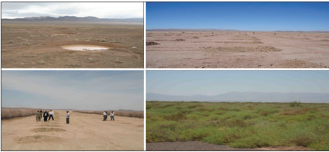
Figures 61-64: Some watershed management projects for saving valuable water of floods for confronting to long periods of drought in South Khorasan province, east of Iran

by changes in agricultural intensity, crop selection patterns, farmland, land productivity and farm income, labor and technological productivity, and major improvements in rural housing and economic and social conditions resulting from industrialization and urbanization. RTD is, in essence, a term that captures changes in traditional rural industries, the employment consumption structure, and the social structure. These changes signify a transformation from previously isolated urban and rural economic structures toward more coordinated urbane rural development. Such transformation radically changes the urban - rural relationship and the relationship between agriculture and industry. On balance, as development proceeds, risk management in rural space should become less needed, and in some sense, easier. Particularly as the private sector develops in its many service roles in rural areas, there will be less need for governments even to ponder intervention for agricultural and other rural development purposes.