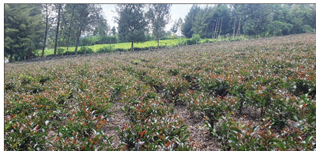
Figure 3: A smallholder purple tea farm in Sotik sub-county, Bomet, Kenya

Green tea is derived from the green leaves, buds, and shoots of the C. sinensis plant, and is processed