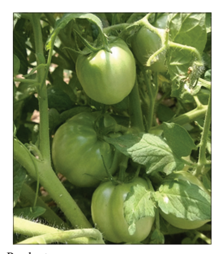
Figure 1: Product appearance

nitrogen variant with 90 kg of active ingredient in the background of 10 t/ha of the experimental scheme. As a result of biochemical analysis, it was found out that the content of "Ilkin" tomato was 7.5%, sugar was 3.6%, total acidity was 0.39%, Vitamin C was 24.86%, and nitrate was 96.7 ppm. As it has been seen here, the norm of nitrogen has not been exceeded in the amount of nitrates contained in the tomatoes for the open field.