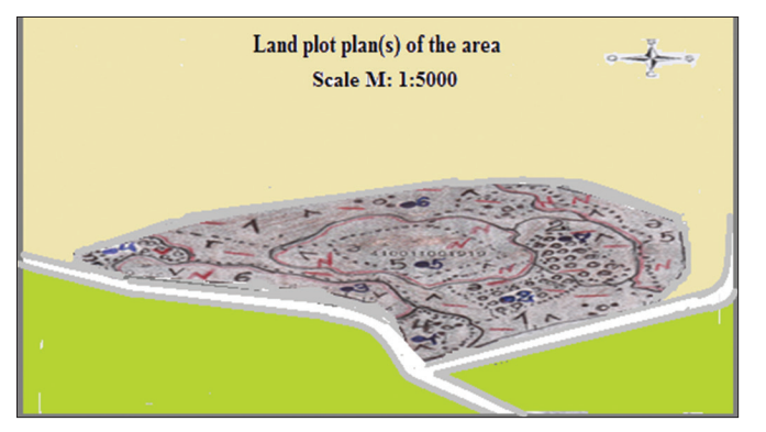
Figure 1: Land plot plan (s) of the areo the village Malham of the Shamakhi

The soils of the site (with a total area of more than 30 hectares) are average loams, gradients of 0.005